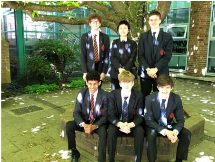
Year 12 A level group

We have a wonderful Year 12 A level group. They have been performing in Chamber Music and singing in a Sixth Form Choir.