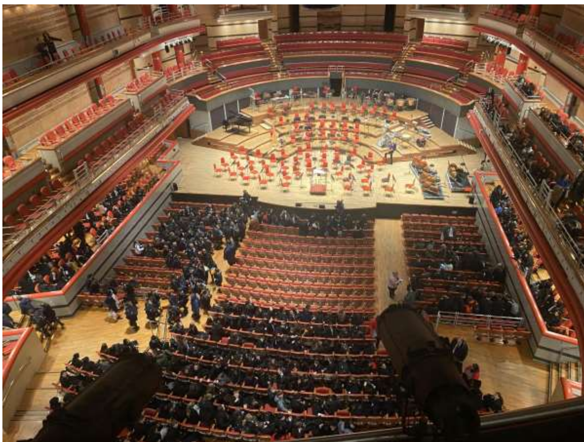
Our view at Symphony Hall

It was a real pleasure to be able to take the whole of Year 7 to Symphony Hall, Birmingham to listen to the City of Birmingham Symphony Orchestra. As a city, we are so fortunate to have one of the best orchestras and concert halls in the world right on our doorstep. For many students this was the first time they had listened to a live orchestra and I hope it helped them put their current Bach to Berio unit into context. For some, I also hope it may have ignited a musical flame within them. The programme was varied including music from Brahms to the score to Avengers: Engame .