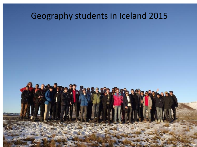
Geography students in Iceland 2015

The structure of the new A-level from is outlined below. Your study will be complemented by at least four days of fieldwork, a range of learning activities, research projects using the department's Ipads, and a broad spectrum of enrichment activities, including external lectures and workshops run by the GA, trips to the Lapworth Museum at UoB and GIS training and competitions. We also encourage our Sixth Form geographers to contribute to the life of the department by supporting activities and events run for students in lower school such as the Eco-Schools Award and the GA WorldWide Quiz.